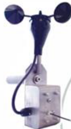
Optional Wind Speed Sensor