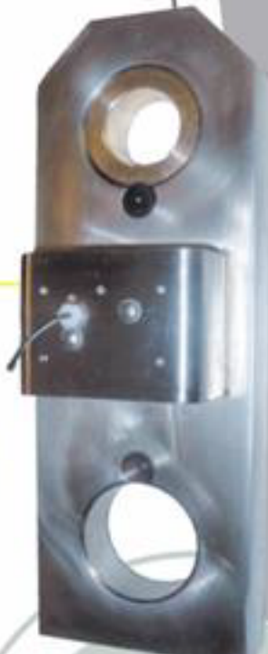
Stainless Steel Load Cell

Monitor ANY combination of Wireless Load, Angle, Hook Radius, A2B & Wind Speed from a single LS420 Display