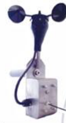
Optional Wind Speed Sensor