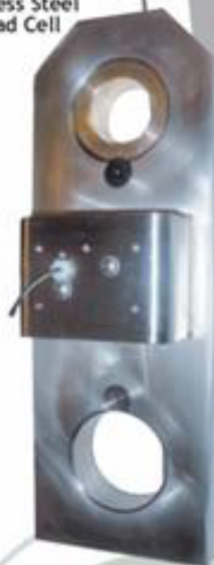
Stainless Steel Load Cell

The LS2002 displays load on hook, working load limit, active hoist, boom angle/length, hook radius, parts of line, tip height, optional anti-two-block and optional wind speed from the color touch screen.